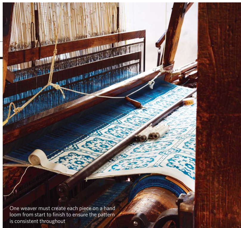
One weaver must create each piece on a hand loom from start to finish to ensure the pattern is consistent throughout