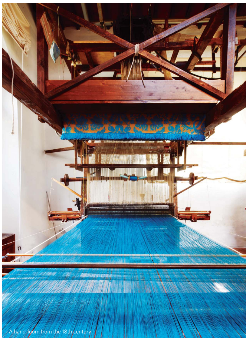
A hand-loom from the 18th century